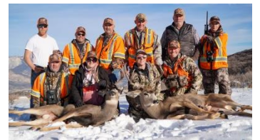
Photos from left to right: 1 st row- Veteran fishing trip out of Bodega Bay, Lake County WWII Veteran, and Vietnam Veterans and volunteers ready for their 2021 Colorado Veteran Hunt.